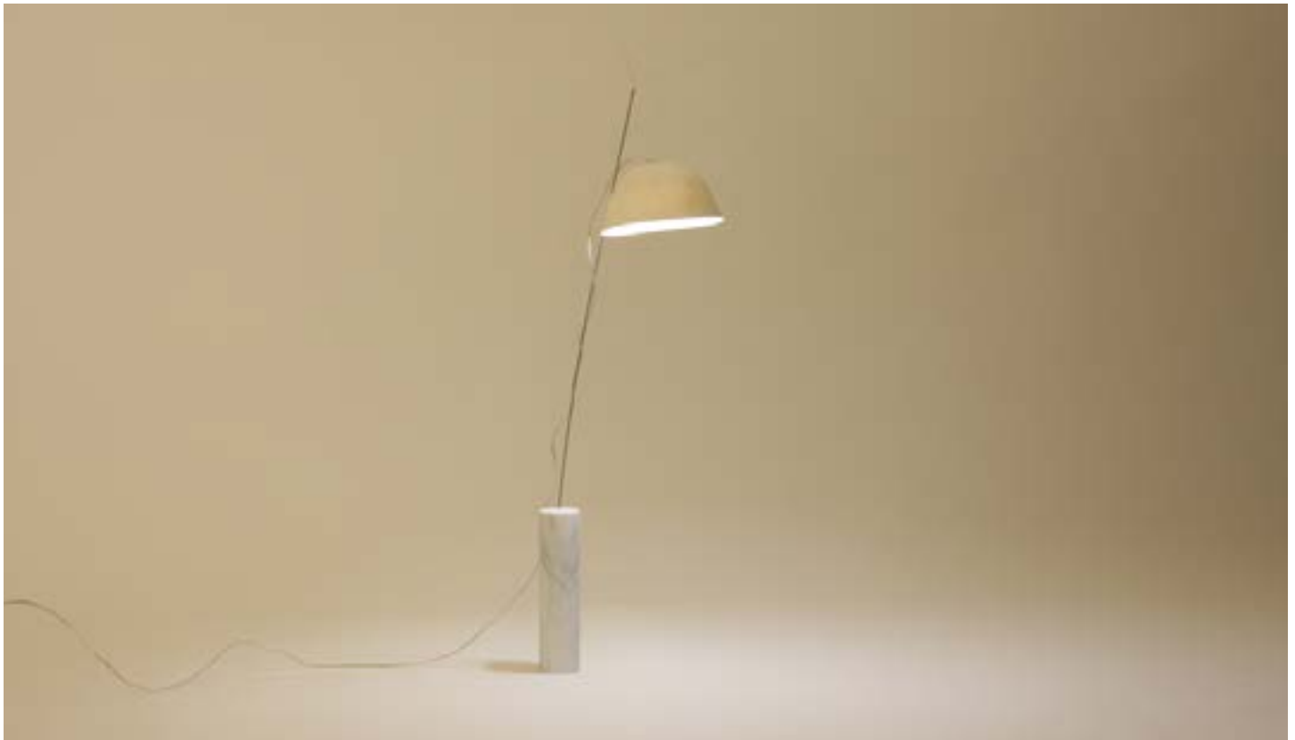
cappello table lamp

1470 Venables Street Vancouver, BC Canada V5L 2G7