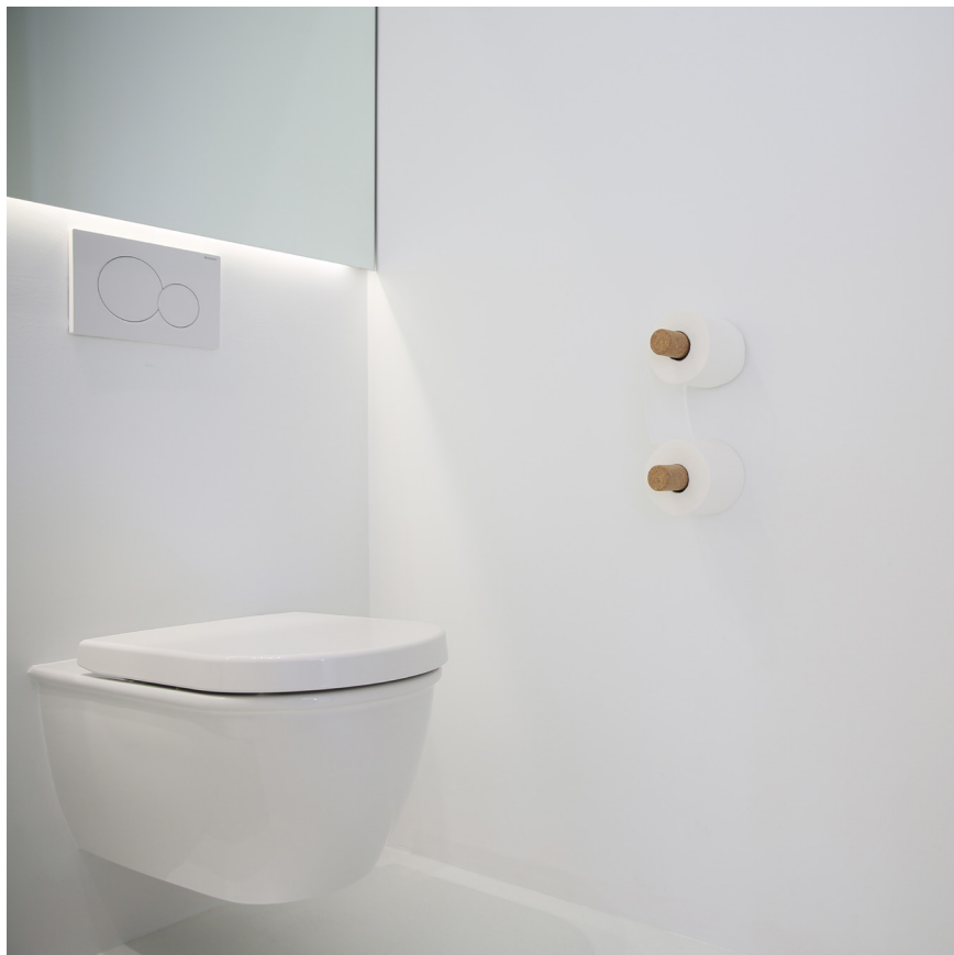
long cork peg works well as a bathroom accessories set of toilet paper and hand towel holders.