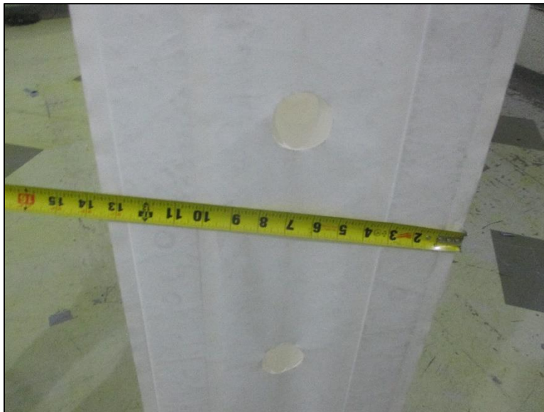
Photo No. 2 Close-Up View of Test Specimen