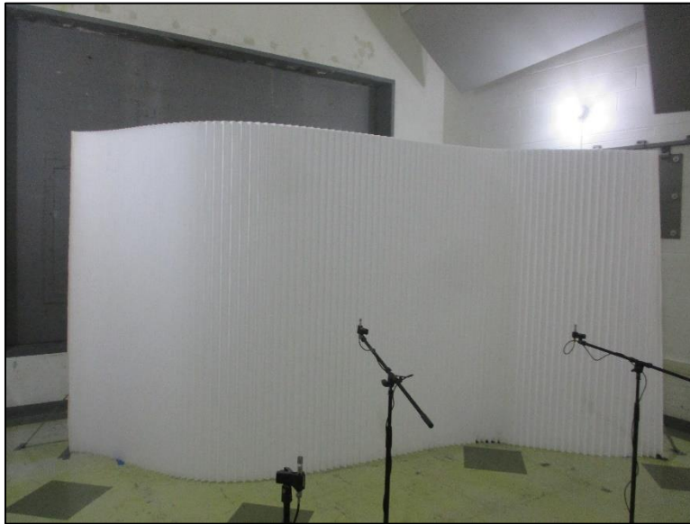
Photo No. 1 View of Installed Test Specimen