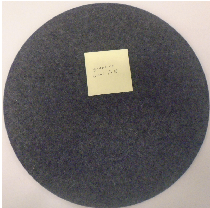
Selected tests as requested by applicant against specified requirement / test request form / quotation.