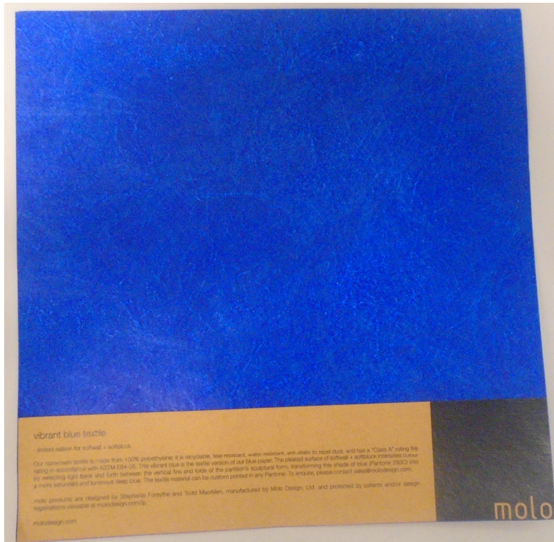
Selected tests as requested by applicant against specified requirement / test request form / quotation.