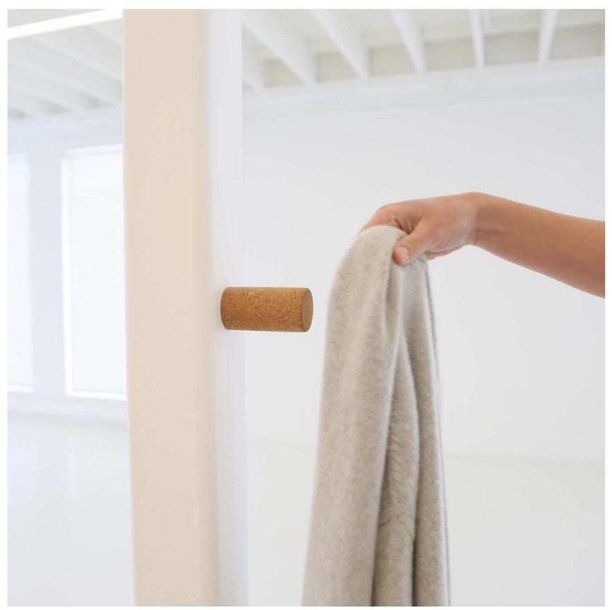
the shorter length is better suited than the long for use as a hook for clothes, bathrobes or bags.